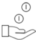
PAY PER SECOND