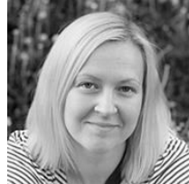
Art & Design Director