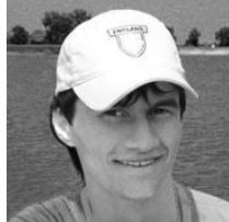
Chief Technical Officer